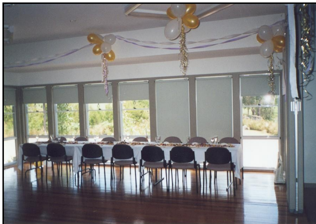
Sample layout for a wedding reception.

All prices are subject to change and include GST where appropriate.