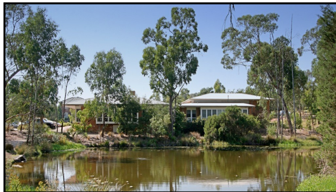
Our function rooms overlook the lake in Yarrunga Reserve.

76 - 86 Croydon Hills Drive Croydon Hills 3136 Melway Map 36 G9