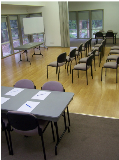
Meeting room 2 is flanked by smaller rooms 1 and 3 to either side.

A non-refundable deposit of $55 (or payment in full if less than this amount) is required when booking the venue and must be submitted with your hire agreement form as soon as you have selected a date/s. The balance of the hiring fee, plus insurance and bond are payable prior to the booked date.